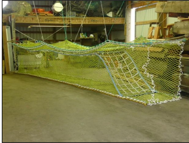
Figure 2: Hallway Halibut Excluder